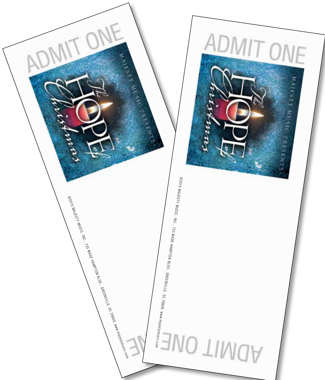
ticket (not to scale, shown larger for instruction purposes)

This PDF is set up to print eight tickets on a 8.5 x 11 (letter size) sheet of paper. The PDF can be placed into any text based editing program or page layout program (Mac or PC). There you will be able to add your own details to the white area of the ticket, such as church's name, date and time of performance. Once printed, the tickets can then be cut into the smaller finished size. If your church does not have access to a high quality color or black & white laser copier/printer, we suggest you take the file to a commercial printer or your local office supply store for printing or copying.