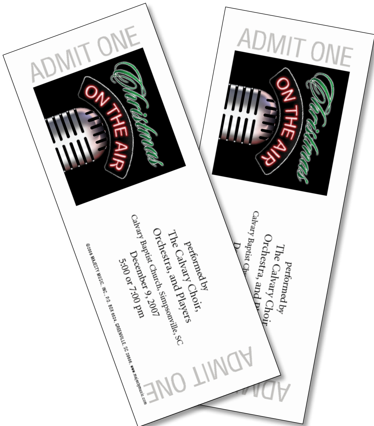
ticket (not to scale, shown larger for instruction purposes)

This PDF is set up to print eight tickets on a 8.5 x 11 (letter size) sheet of paper. The PDF can be placed into any text based editing program or page layout program (Mac or PC). There you will be able to add your own details to the white area of the ticket, such as church's name, date and time of performance. Once printed, the tickets can then be cut into the smaller finished size. If your church does not have access to a high quality color or black & white laser copier/printer, we suggest you take the file to a commercial printer or your local office supply store for printing or copying.