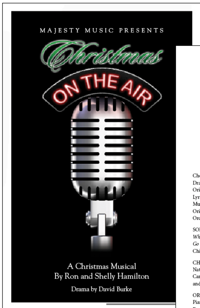
front of program

This PDF is set up as two 5.5 x 8.5 programs on an 8.5 x 11 (letter size) sheet of paper which will print on both sides and trimmed to the final program size of 5.5 x 8.5. The Christmas on the Air art will be on the front, and your church's information on the back. The PDF can be placed into any text based editing program or page layout program (Mac or PC). There you will be able to add your own program details to the back page, such as church's name, date and time of performance, cast, crew and choir members' names. If your church does not have access to a high quality color laser copier/printer, we suggest you take the file to a commercial printer or your local office supply store for printing or copying.